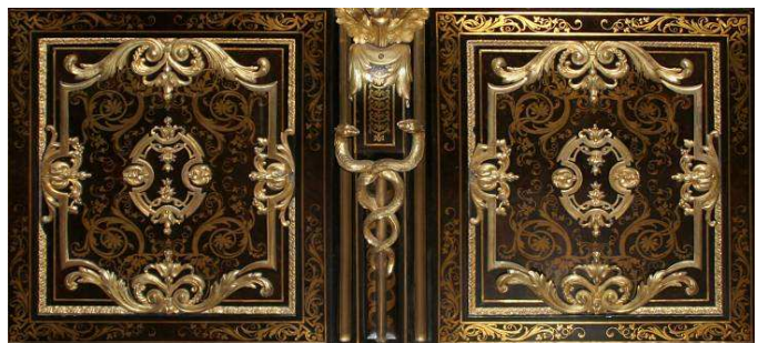
André Charles Boullé (1642-1732). Médaillier dit « de Jules Robert de Cotte ». 1723. Détail. Saint Petersburg, Musée de l'Ermitage.